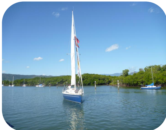
The crew on Ice prepared for the Australia Day Low Isles Race and Doug Ryan solo on Magic advancing to the line