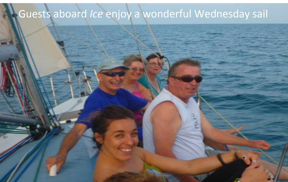
Guests aboard Ice enjoy a wonderful Wednesday sail

Wednesday 23 rd started out wet and overcast but as usual the weather cleared and by the afternoon seven boats took to the water. Magic, Miriama, Ice, Samantha, Sinabada, Impact and Freda filled their decks again providing a place for everyone looking to go for a sail. The winds picked up a little from the 6 or 7 knots that blew most of the day and a great sail was enjoyed by all. The mist and haze blocked out any hope of a good sunset and Samantha won the rum for the second consecutive week.