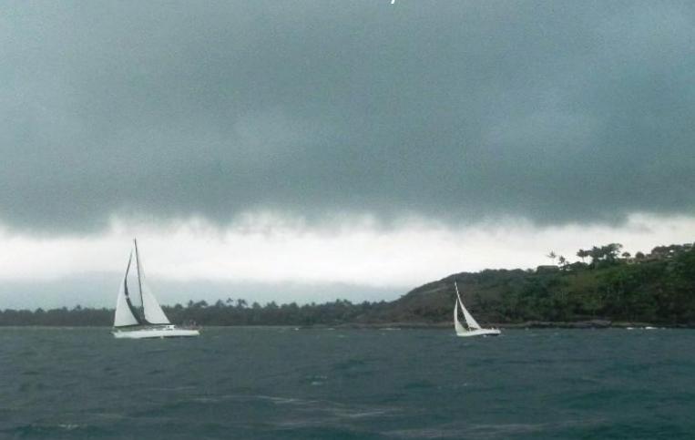
Miriama and Ruff Red under heavy skies in Race 6 of the Poseidon Sailaway Summer Series

The eight yachts that set sail had to contend with an afternoon of winds ranging from 5 to 27 knots coming through 225° of the compass. After another close start the first windward leg was a typical beat to the windward mark. Magic led the way with Ann Sea hot on her tail into the second lap. Tau Ceti broke away from Miriama, Ice, Big Ears and Ruff Red as Indigo began to make up for another late start. The lead chopped and changed hands as Magic and Ann Sea led the fleet around the course in a very close contest. By the third lap the shifting wind had changed the game as both the upwind beat and downwind run became a good reach in the moderate wind caused by a passing storm. As quick as it came up the wind was gone and several boats found themselves struggling to hold course as the breeze dropped down to single figures. Within minutes another passing squall delivered plenty of strong gusts and some driving rain as the race concluded in conditions that would normally cancel the start of any race. Magic took line honours 13 secs ahead of Ann Sea but the wind had played a major role in reversing the fortunes of many yachts able to shorten their course in the changing winds. Despite arriving late to the start handicap adjusted times gave Indigo (58:34) her first win of the series ahead of Ann Sea (01:01:51) and Tau Ceti (01:01:57). Miriama (01:02:28) was fourth, then Magic (01:17:11), Ice (01:06:58), Ruff Red (01:06:59) and Big Ears (01:08:22).