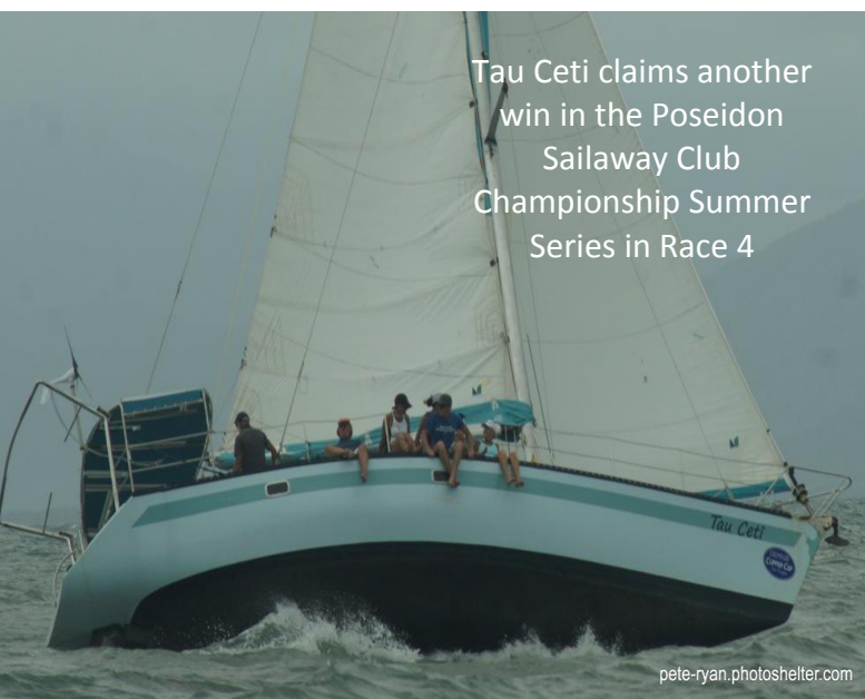
Tau Ceti claims another win in the Poseidon Sailaway Club Championship Summer Series in Race 4

With handicap corrected times dramatically narrowing the time difference and a matter of minutes and seconds separating the contenders victory went to Tau Ceti followed by Big Ears and Sea Wizard, then Miriama, Magic, Ice and Ruff Red.