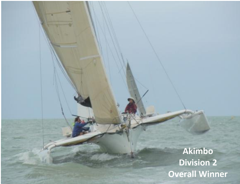
Akimbo Division 2 Overall Winner

The 2012 Exemplar Clipper Cup Regatta dominates this issue of the club Newsletter. Regular articles will continue in the next edition.