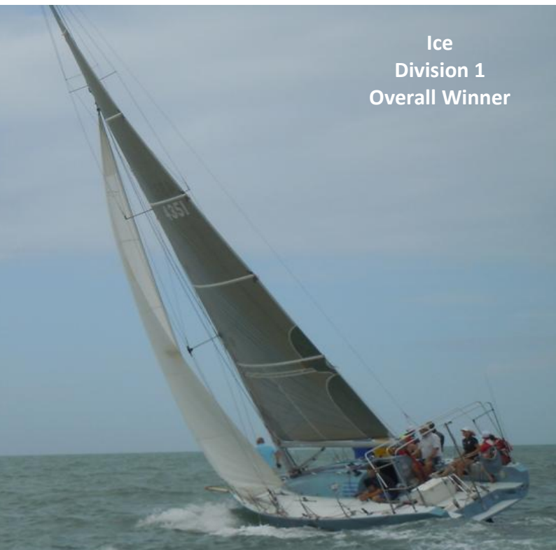
Ice Division 1 Overall Winner