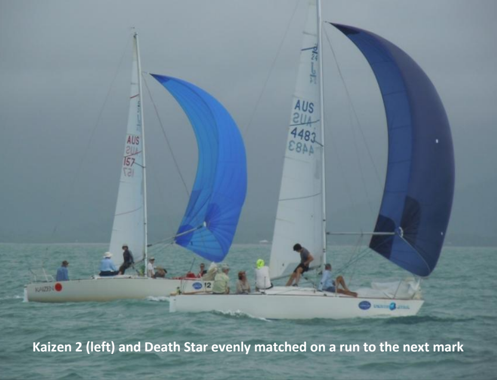
Kaizen 2 (left) and Death Star evenly matched on a run to the next mark