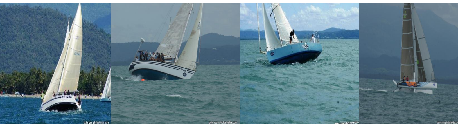
Clipper Cup Bottoms Up: L-R Groove, Farr Better, Ice & Malice

"Sailing is a good sport. You don't have to beat up the other guy like you do in boxing or footy; you just try to outsmart him, and then you have a beer with him".