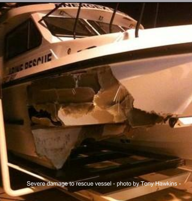
Severe damage to rescue vessel

Part 2 of the Nautical Knowledge feature on COLREGS continues next month.