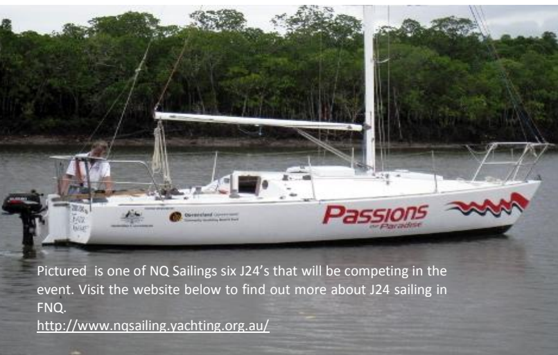
Pictured is one of NQ Sailings six J24's that will be competing in the event. Visit the website below to find out more about J24 sailing in FNQ. http://www.nqsailing.yachting.org.au/