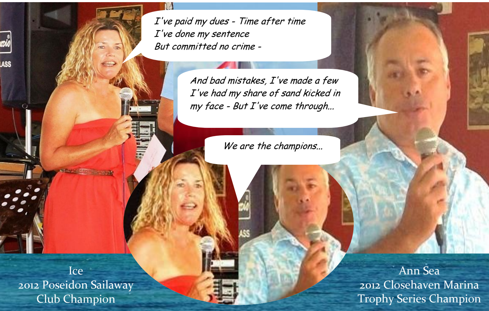
Ice 2012 Poseidon Sailaway Club Champion

The ten race 2013 Closehaven Marina Trophy Series gets underway on March 16 th with the Closehaven Cup.